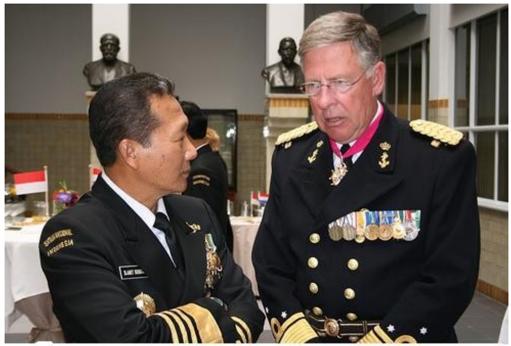
Vice-admiral Kelder of the Dutch navy and his Indonesian colleague on the occasion of the signing of the contract for the Schelde corvettes.

Campagne tegen Wapenhandel (Campaign against Arms Trade) Amsterdam, December 2007